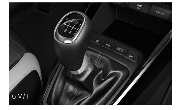
Manual transmission 6-speed transmissions offer quick, smooth gear changes and gear ratios that are matched to engine torque curves, boosting power and efficiency.