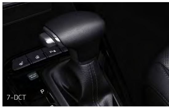
Automatic transmission Enjoy smooth acceleration, agile gear shifts and fuel economy with the 7-speed DCT Dual Clutch Transmission. Coming Soon!

When you're just as happy zipping around the city streets as you are exploring what's over the next horizon, the Kia Stonic's choice of two extremely reliable petrol engines offers dynamic performance with lower emissions, making every drive you make a joy and a pleasure.