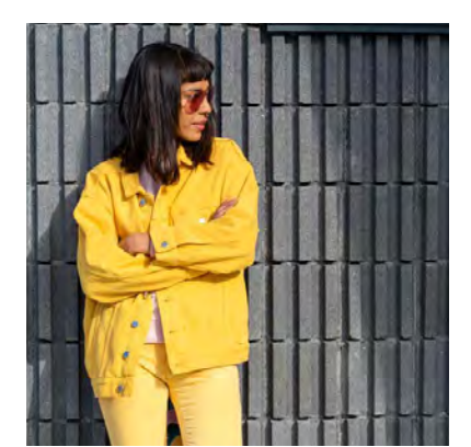
LIFE IS WHAT YOU MAKE OF IT.